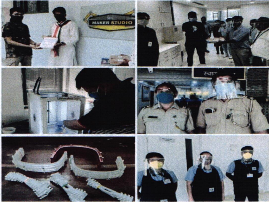
Preparation and distribution of protective shield to the frontline workers