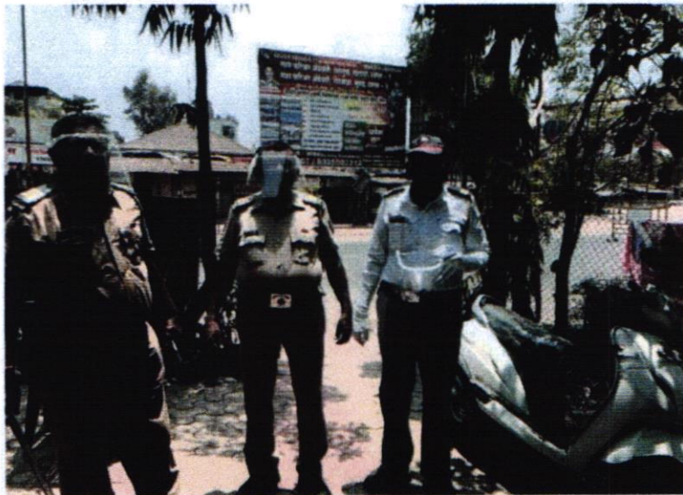
Distributing protective shields to frontline Corona warrior